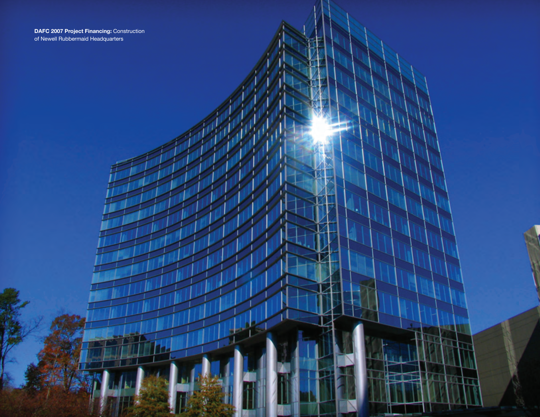
DAFC 2007 Project Financing: Construction of Newell Rubbermaid Headquarters